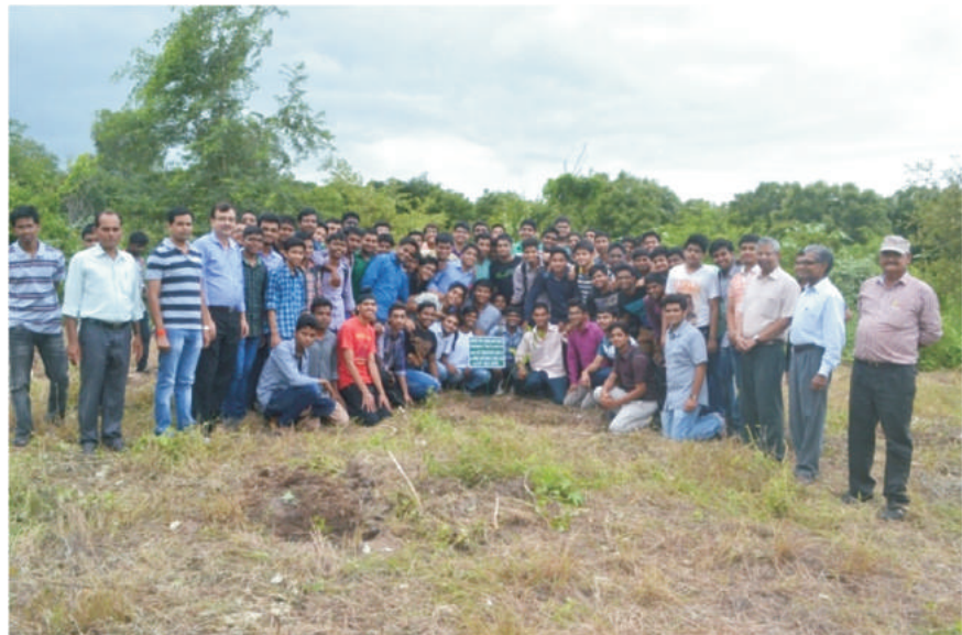
Tree plantation by IPG New entrants Batch 2015