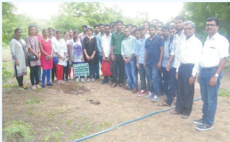
TREE PLANTATED BY MBA & M.TECH NEW ENTRANCE BATCH 2015