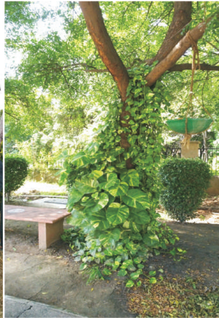
Tree plantation on 15th August 2015